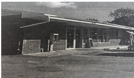
Pictured at left: Uni-mart store located on property prior to 1997. Center and right: Our Lodge Hall as it looks today.

To celebrate this milestone we would like to invite all Retirees and Active Members to our hall for snacks and refreshments on Wednesday, June 5th. Open house hours will be: 3:00 PM–4:30 PM / 11:00 PM-12:30 AM / 7:00 AM-7:30 AM